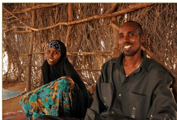
Community Health Workers in the MV of Dertu (Kenya).

The event included the release of The Millennium Villages Project: The Next Five Years: 2011-2015 , a report detailing gains made since the MVP's start in 2006, as well as plans for the Project's next five years. (View the report in its entirety at report.millenniumvillages.org .)