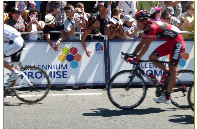
The Millennium Promise logo featured prominently at the UPCC race in August 2011, which helped raise awareness about Community Health Workers.

The UK’s Department for International Development (DFID) will provide funding over the next 5 years to support this new MV in northern Ghana. The Project will offer a set of interventions to communities to lift themselves out of extreme poverty while improving health systems and fighting hunger and malnutrition with the aim of achieving the MDGs. At the same time DFID will